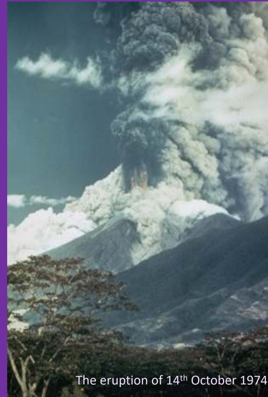
The eruption of 14 th October 1974 4